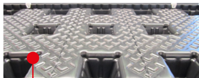
TwinSheet pallet sealed