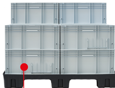
Raised pallet edge; thus no slipping of the load carrier.